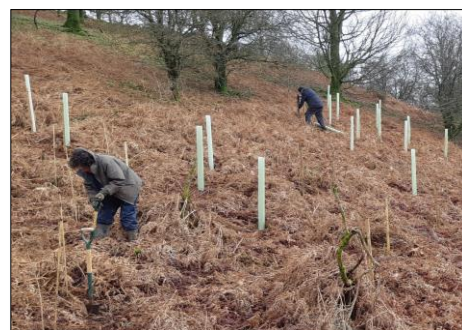
Birds Park, Stock Beck

As with any other flood risk management scheme, there will be some impacts. However, we continue to undertake habitat surveys and environmental assessments to ensure we understand those risks and ensure they can be managed. By identifying opportunities across the catchment, our proposals will not only provide mitigation to lessen the impacts, but will result in an improved environment for wildlife, the community, and visitors to the area.