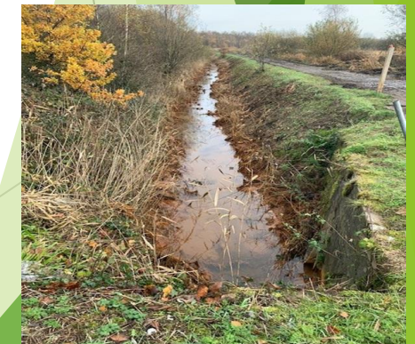
Another watercourse after a 2m wide vegetation cut