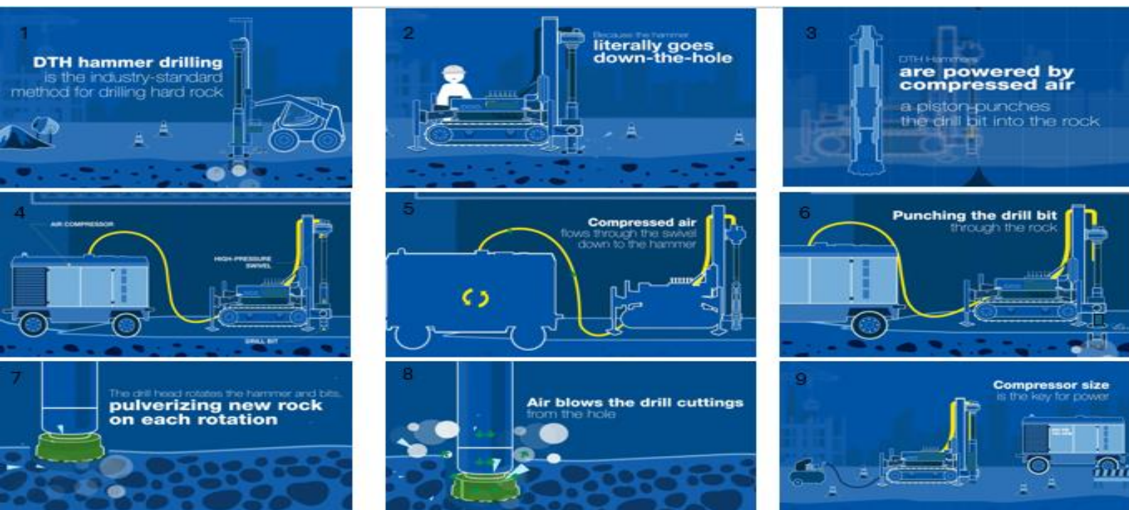
Stages of using the SPIRAL FLUSH method

The below diagrams explain the Spiral Flush method which will be used along Waterside to create the foundation for the new glass topped flood wall.