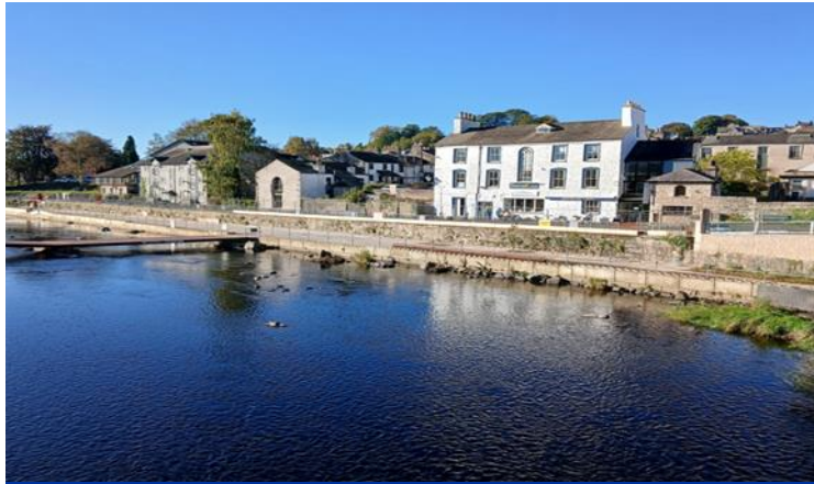
Waterside and the temporary working platform