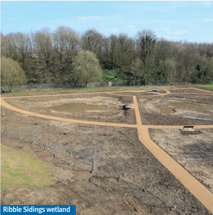
Ribble Sidings wetland

South Ribble Borough Council has almost completed its refurbishment of the adjacent children's playground. Together, the new wetland and playground will be a fantastic community resource for the local area.