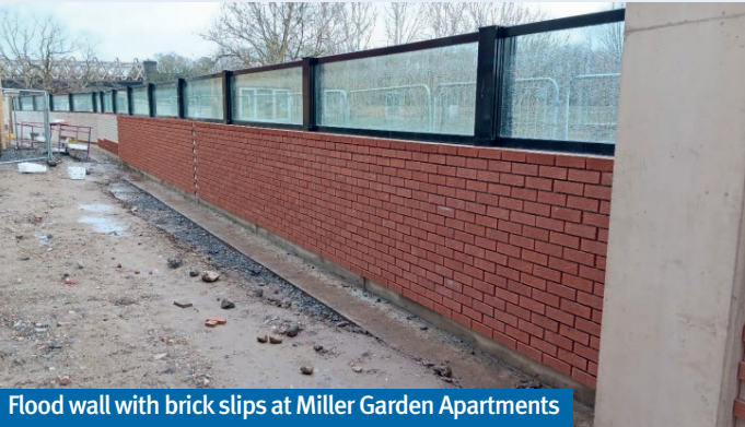
Flood wall with brick slips at Miller Garden Apartments

With the installation of the bespoke glass panel near the Gas Pipe Bridge and repairs to the lower masonry wall by Penwortham Old Bridge, works along Broadgate and the first section of Riverside are now complete.