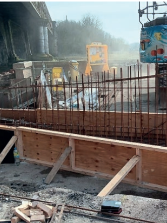
Threshold shuttering ready for the concrete.

In the event of a flood warning, Environment Agency officers would close the new flood gates to protect properties in the South Meadow Lane area. However, Miller Park remains part of the flood plain.