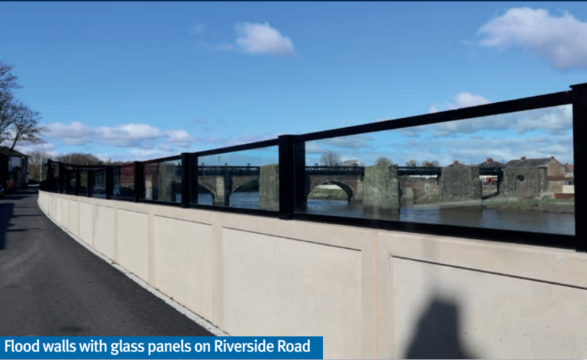
Flood walls with glass panels on Riverside Road

Construction of the new defences in Lower Penwortham is now complete. The only remaining work is along a section of the old wall near Penwortham Old Bridge. As part of the Flood Scheme, we have reinstated the road and pavements on Riverside Road. While along the river, new paths and planting have been completed too.