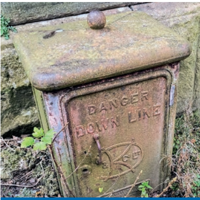
Dick, Kerr & Co Box near the West Coast Main Line

The team carefully removed the box from its original location, and it has now been handed over to Preston City Council. The Council plans to find a new home for the box, allowing the public to appreciate this important part of local history.