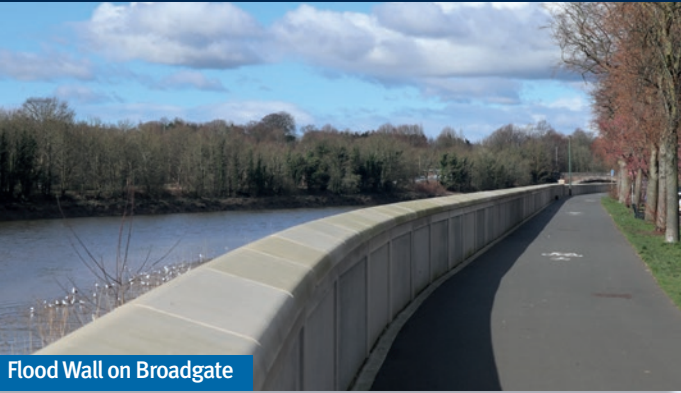
Flood Wall on Broadgate