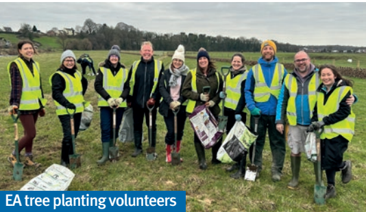
EA tree planting volunteers

As part of the Flood Scheme, we committed to replacing every tree removed during construction with 12 new ones. Fishwick Bottoms in Preston has been central to achieving this goal.