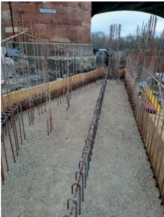
Concrete poured and now ready for the new floodgate frame.