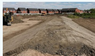
RADCLIFFE AND REDVALES