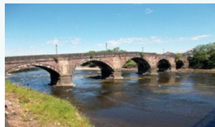
PRESTON AND SOUTH RIBBLE