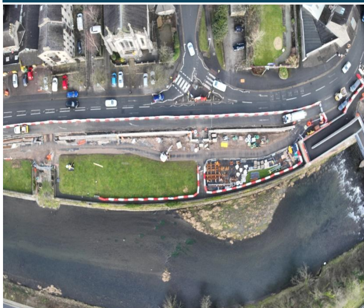
Aerial view of New Road Common during construction