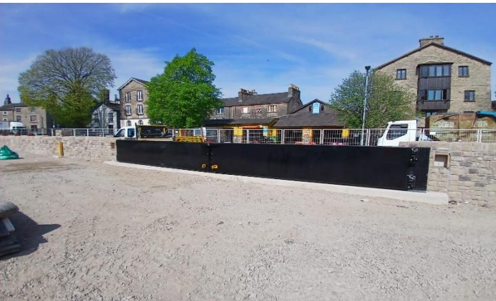
Flood gate leading to the slipway

Once all works are finished, the area adjacent to the Common at Melrose place will be landscaped. Once complete, the vehicle lane closure will be removed and full access to the common will be returned for the community to sit, relax and enjoy.