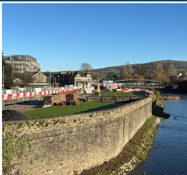
View of New Road Common from Miller Bridge during construction