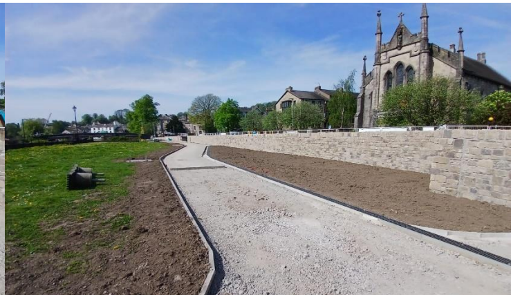
New pathway leading through the common