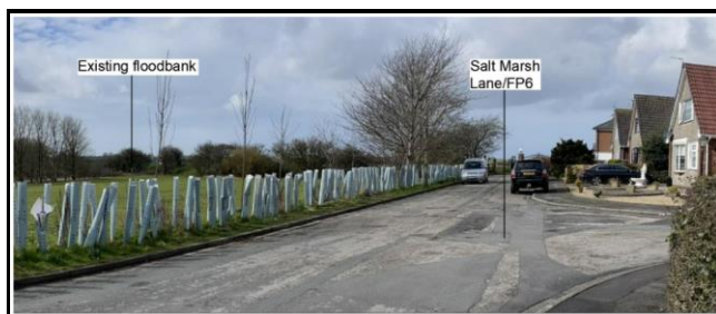
Figure 3 - View along Salt Marsh Lane, pre-construction mitigation hedgerow and tree planting

trees and hedgerows will need to be removed to enable construction of the scheme. Replacement planting will be undertaken at a minimum of a 5:1 ratio.