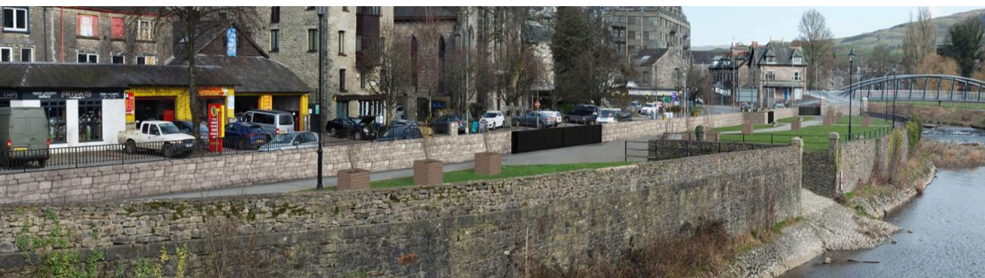
Visualisation showing flood wall and access point to New Road Common following completion