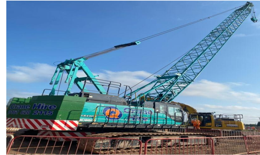
Large crane to remove the piles

Traffic Management: Cones will be placed on the corner opposite the site entrance to maximise manoeuvring space for the crane.