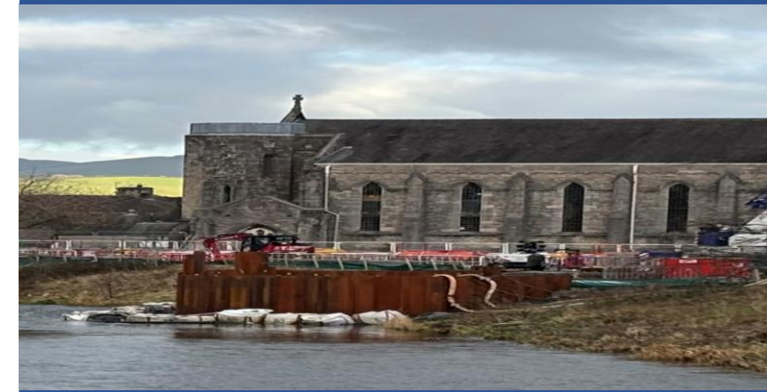
Piles of the cofferdam to be removed