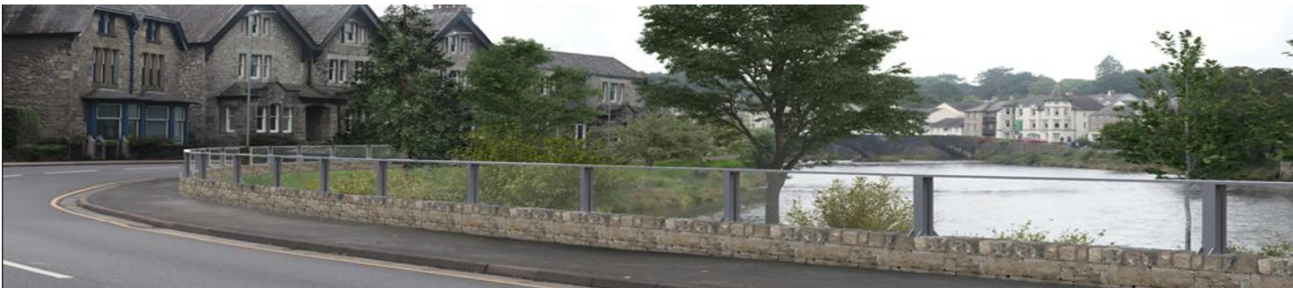
At the southern end of Aynam Road a new flood wall will host a viewing platform up the river and a new access down to the ford.