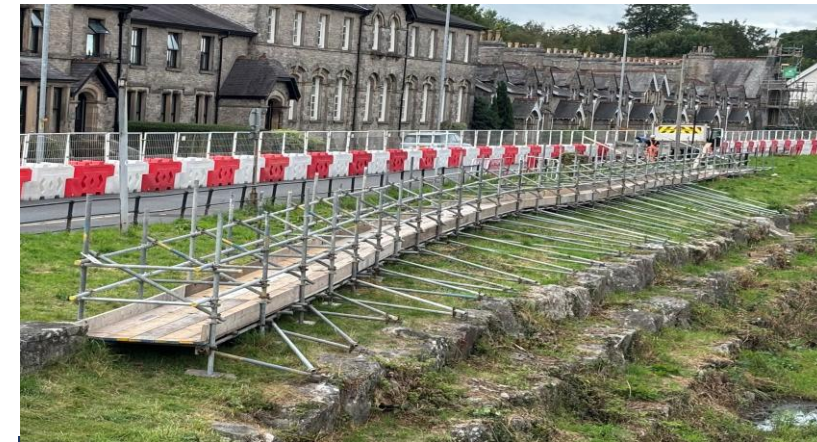
Scaffolding erection along Aynam Road

In order for us to undertake further site preparation, a full vehicle lane closure along the riverside is now in operation along Aynam Road. Vegetation clearance has been undertaken along the riverbank which followed with the placing of a number of rock rolls along the riverbank to provide additional riverbank stability. These have been placed in addition to the existing rock bags which are in place at the foot of the riverbank providing the necessary stability when we come to excavate and construct the flood wall. Scaffolding is currently being erected along the riverbank which will secure BT cabling away from the immediate construction area.