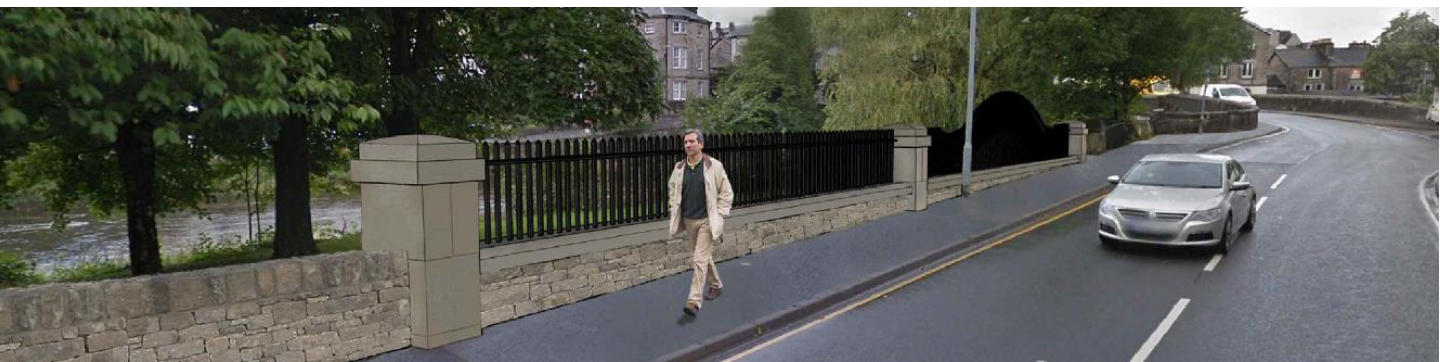
Along the central section of Aynam Road, glass panels will retain much loved riverside views.

The flood scheme will incorporate a range of public realm features along Aynam Road. The north end of the river near Miller Bridge, Webster railings will create a gateway onto a new riverside footpath.