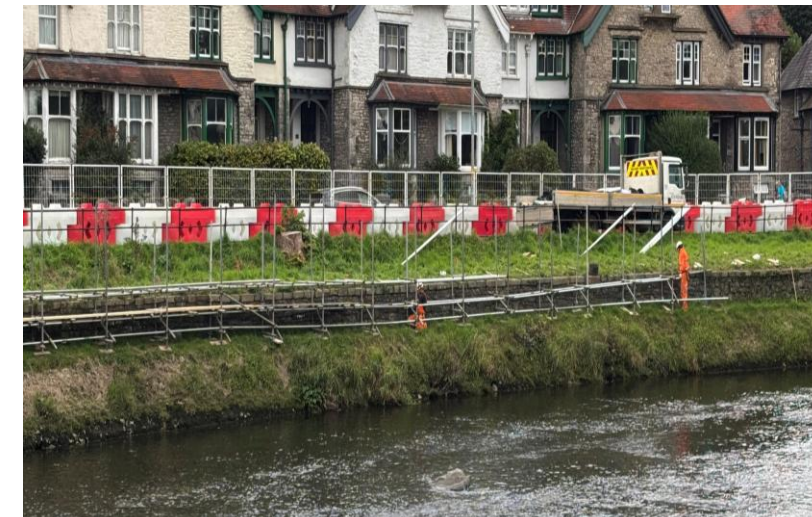
Scaffolding erection along Aynam Road