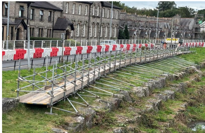
Scaffolding erection along Aynam Road

Scaffolding is currently being erected along the riverbank which will secure BT cabling away from the immediate construction area.