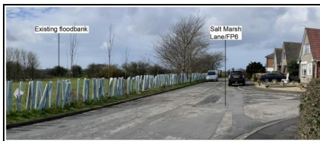
Figure 3 - View along Salt Marsh Lane, pre-construction mitigation hedgerow and tree planting

enable construction of the scheme. Replacement planting will be undertaken at a minimum of a 5:1 ratio.