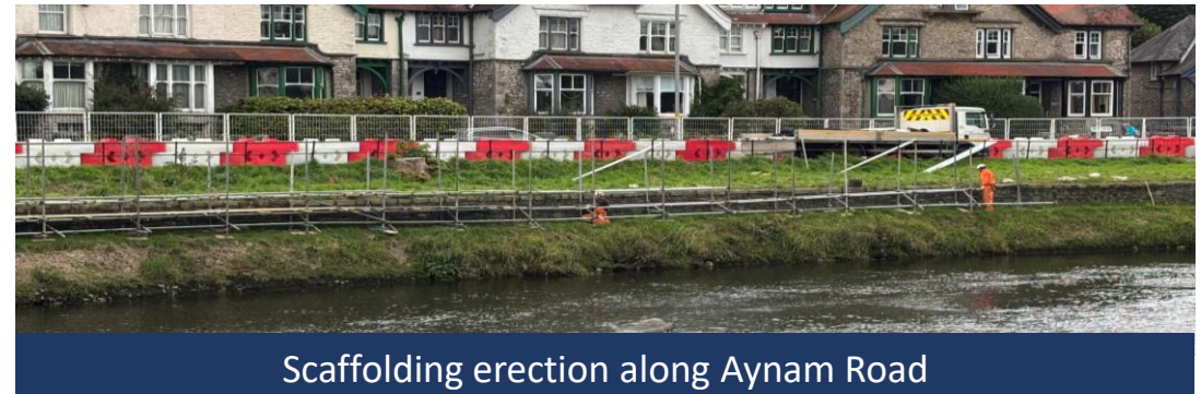
Scaffolding erection along Aynam Road