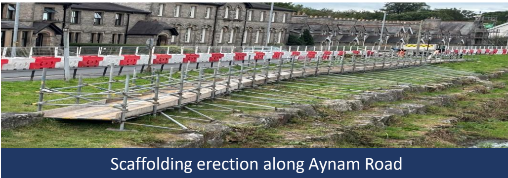
Scaffolding erection along Aynam Road

We would like thank you for your continued patience and wish everybody a very Merry Christmas and a Prosperous New Year