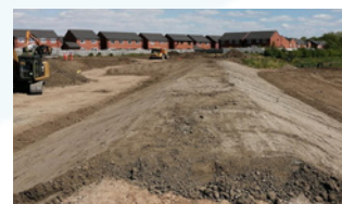
RADCLIFFE AND REDVALES