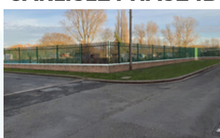
CARLISLE PHASE 1B