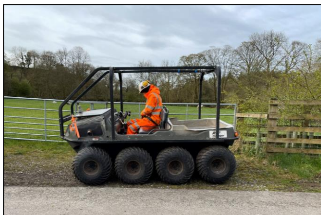
An argocat vehicle

Due to the distances needed to travel, the team are planning to use an 'argocat' to access the area. This is a small 8 wheeled off-road vehicle, designed to travel over difficult terrain like mud, snow and water. Use of the argocat will mean that we do not need to lay down track matting.