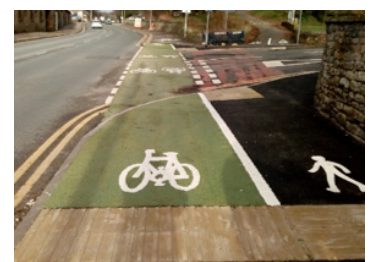
Example of junction markings where cyclists have priority