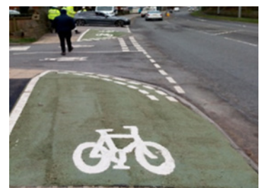
Example of junction markings where cyclists do not have priority