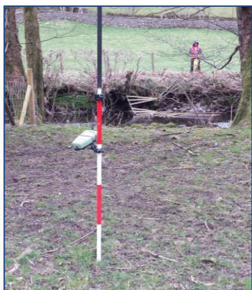
GPS pole, topographical survey equipment

Once we have a robust flood model and have a concept scheme design, we will instruct a number of surveys to be carried out on key structures e.g. walls and bridges to identify the structural integrity of existing infrastructure which may form part of, or be impacted by our proposals. It's likely this will take place in Spring 2022 but we will keep you updated.