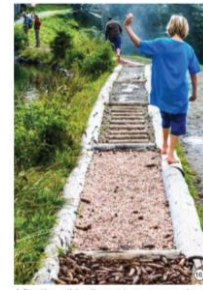
A 'tactile path' will provide a sensory play experience