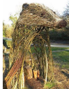
Public artwork using natural materials.